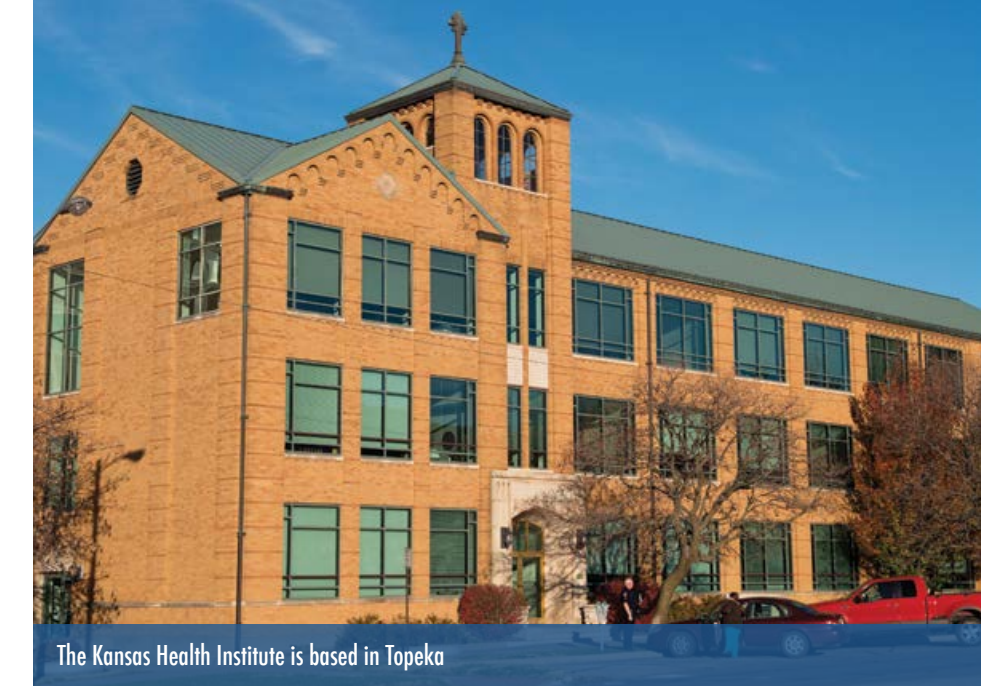
The Kansas Health Institute is based in Topeka